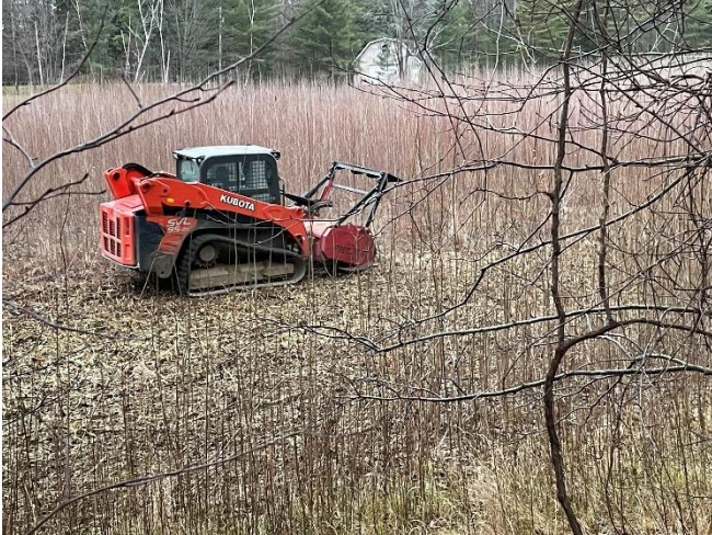
West Branch Bay Cutting November 2022

In November 2022, Secord Township contracted Mid Land Maintenance, LLC to remove nuisance trees in large public boating areas that extended into the lake.