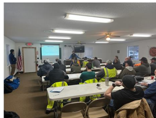
Safety training with Fisher Contracting for Secord and Smallwood dams

It is our understanding the Secord auxiliary spillway will be a very large structure that will take up most of the area on the east side of the dam / river toward the Secord Dam Road bridge. We can see the staging area being prepared on the west side of the dam as the sheet piling project continues along the east side. We plan to conduct a series of monthly meetings with construction updates beginning in April.